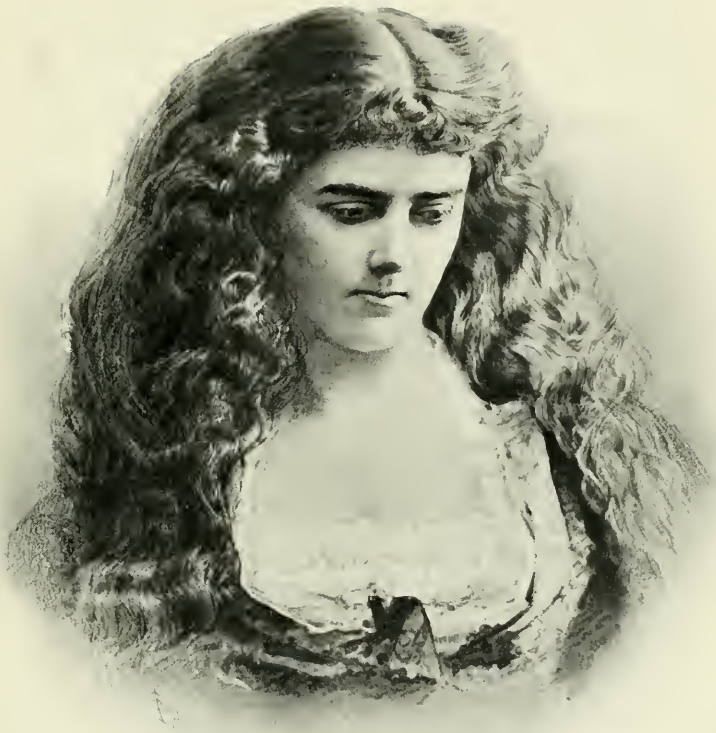
GEORGIANA, COUNTESS OF DUDLEY.